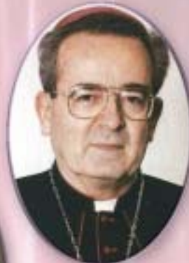
Archbishop Justin Rigali