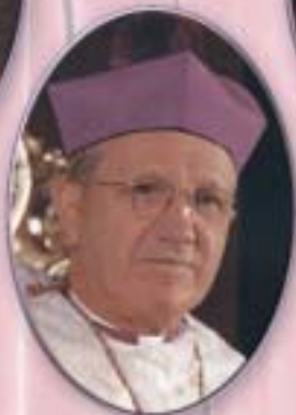
Cardinal Joseph Ritter