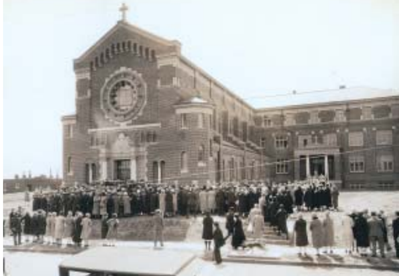
Above, blessing the cornerstone. Right, the opening day celebration on June 7, 1928.