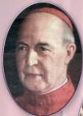
Cardinal John Glennon