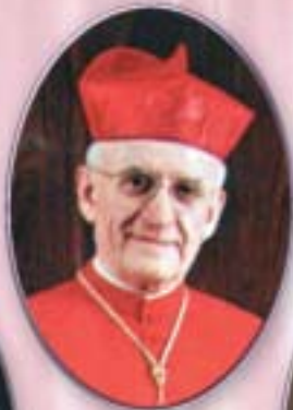
Cardinal John Joseph Carberry