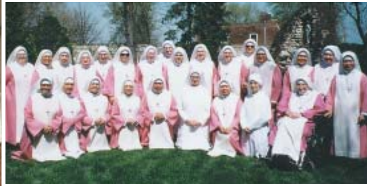
Above, the Mount Grace Community today.