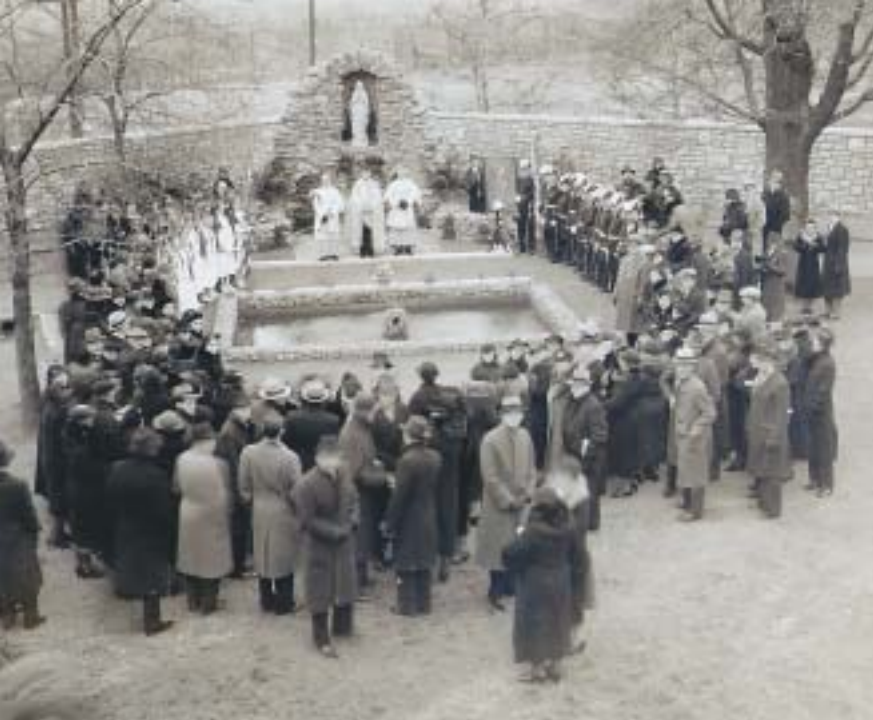
The dedication of the Lourdes grotto on December 6, 1936.